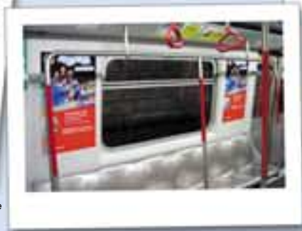
The interior of a MTR train is covered by posters of MassMutual Jr. Space Camp.