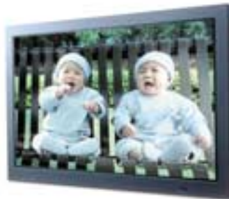
Spot the difference? In fact, the twin baby roles were actually played by a single baby girl!

It is our hope that our customers will appreciate our highly flexible insurance products, and the professional and accommodating services provided by our insurance consultants will meet their needs, so that our customers will always be happy and satisfied.