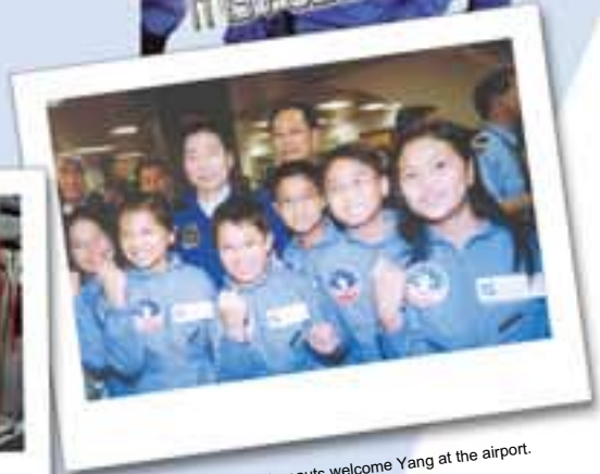
Six MassMutual Jr. Astronauts welcome Yang at the airport.