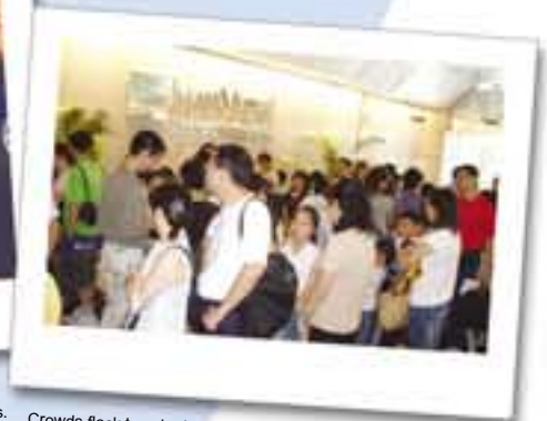
Crowds flock to submit their applications on the Recruitment Day.