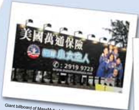
Giant billboard of MassMutual Jr. Space Camp at the entrance of the Cross Harbour Tunnel.