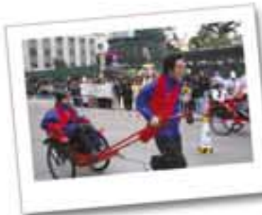
Hong Kong Agency participates in the Charity Rickshaw Race every year.

Our insurance consultants not only provide professional financial and insurance advice to our customers, but also actively involved in various charity and community services, such as "Charity Rickshaw Race" and "Red Cross Blood Donation Day", and render help to those in need.