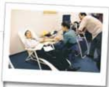
Macau Agency gets actively involved in the Red Cross Blood Donation Day.