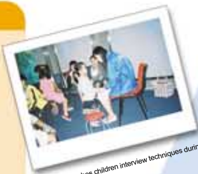
Instructor teaches children interview techniques during the mock interview.