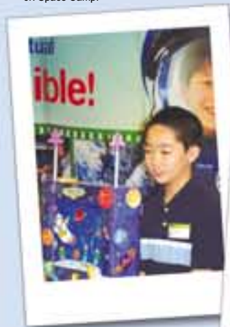
Children carefully prepare their creative works to ensure they get to be Jr. Astronauts.

The Recruitment Days took place on June 27 and 29 in Hong Kong and Macau respectively. Nearly 2,000 children and parents submitted their applications together with their creative works to MassMutual Asia offices in person.