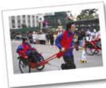
Hong Kong Agency participates in the Charity Rickshaw Race every year.

Our insurance consultants not only provide professional financial and insurance advice to our customers, but also actively involved in various charity and community services, such as "Charity Rickshaw Race" and "Red Cross Blood Donation Day", and render help to those in need.