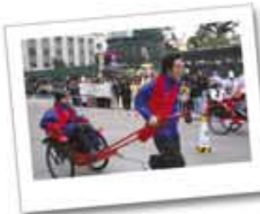
Hong Kong Agency participates in the Charity Rickshaw Race every year.

Our insurance consultants not only provide professional financial and insurance advice to our customers, but also actively involved in various charity and community services, such as "Charity Rickshaw Race" and "Red Cross Blood Donation Day", and render help to those in need.