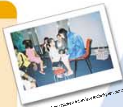
Instructor teaches children interview techniques during the mock interview.