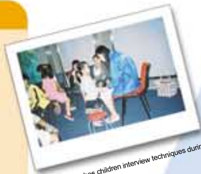
Instructor teaches children interview techniques during the mock interview.